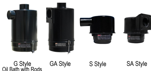
G Style Oil Bath with Rods

The G and GA styles of Oil Bath Air Cleaners are engineered for heavy use of large quantities. They are composed of four elements: the Body Assembly, Prefilter, Disc, and Cup. The Body Assembly houses the Vortex Air Technology filter element, which is made of finely coiled interlocking steel wire and will sustain the life of the product. The continuous circulation of oil throughout the cleaner on a controlled basis from low to high air velocity creates a large dust holding capacity. The Prefilter catches chaff and lint before it reaches the main filter and deflects the heavier dirt and oil into the oil Cup. The Prefilter is also easily removable for quick servicing. The Disc controls the proper measuring and dispersion of oil from the Cup. The Cup serves as an oil and dirt reservoir.