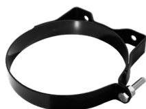
BB Band Brackets