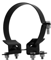
BA Saddle Brackets