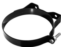
BB Band Brackets

BA Saddle Brackets originated the Band and Saddle Bracket line. Originally designed to mount our G style Oil Bath Air Cleaners, BA Saddle Brackets mount securely and snugly to any unit with four mounting bolts located on two adjustable legs, which offer custom fitting. Current models range from 127 mm to 342.90 mm in diameter. Customization available upon request.