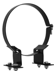
BC Saddle Brackets